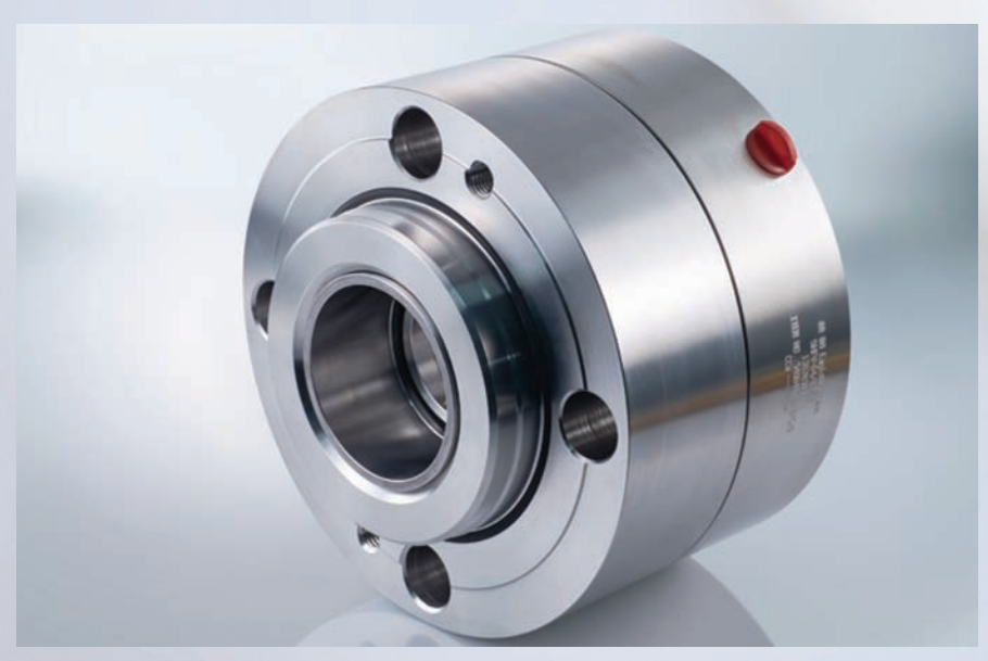
The SHVI single seal from EagleBurgmann is specifically designed for high pressures and speeds.

Plan 66A, which has been available since introduction of API 682 4th Edition, was the obvious choice for the safety concept. Accordingly, the seal housing contains two throttles, and the seal chamber is connected to a pressure transmitter.