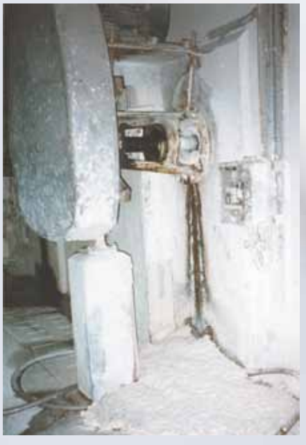
Soiling and product loss: Accumulated leakage at a side-driven chest agitator sealed with a packing.

The seal has been in operation at Sappi Lanaken without problems since conversion of the system in January 2002. Due to this success, the company has decided to convert further chest agitators to the EagleBurgmann HGH210 seal.